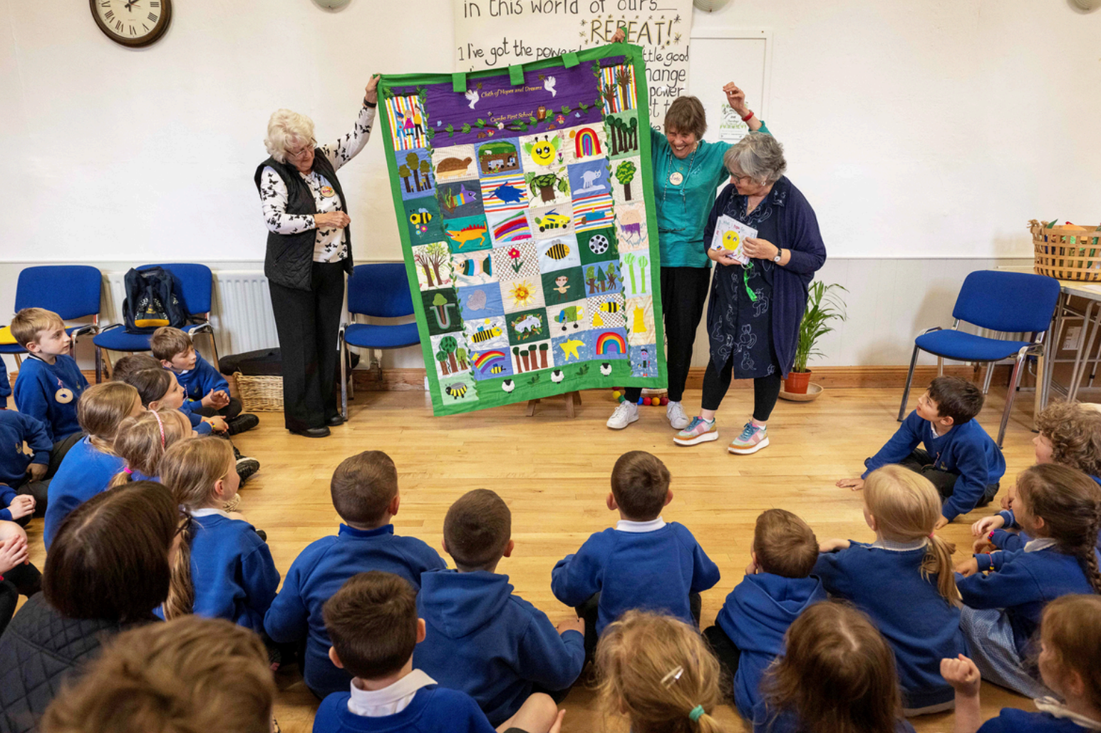
The Sacred Trails Group with Children from Cambo School to get creative to show they care about God's creation - part of the "Fragile Earth Project"