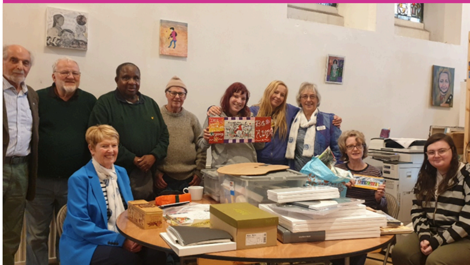
Mothers' Union members donate art materials to the Art Club at St James Church

All recipients are asked, as a condition of the grant, to submit to the Trustees a report on the way in which the money has been spent and what has been achieved as a result on the Report Feedback Form that will be provided once the grant has been awarded. This should reach the Secretary within six months of receipt of the grant received. Additionally, one or more of the Trustees may ask to make a personal visit to the project concerned.