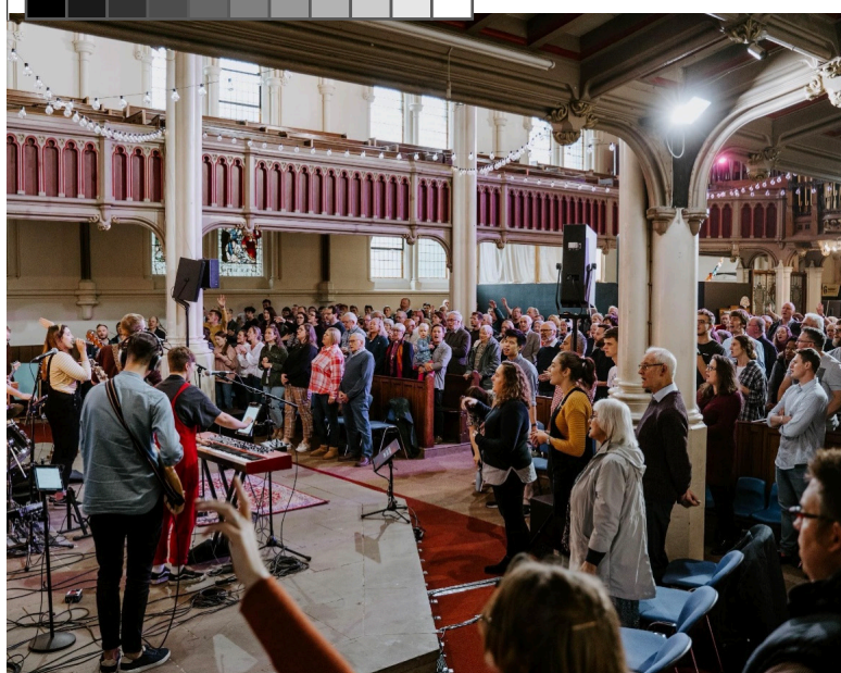
The launch of St Thomas', October 2019

students with the fabric and life of the city at the centre, not the edge, and of course, we encourage people to stay here after their studies if it is possible.