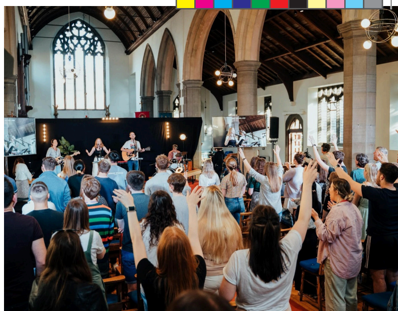
St Thomas' at St Hilda's, October 2021

Were the whole realm of nature mine, That were a present far too small; Love so amazing, so divine, Demands my soul, my life, my all.