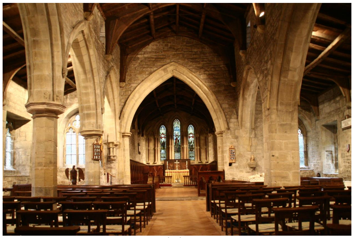
Interior looking east

The interior walls of the church are bare of plaster.