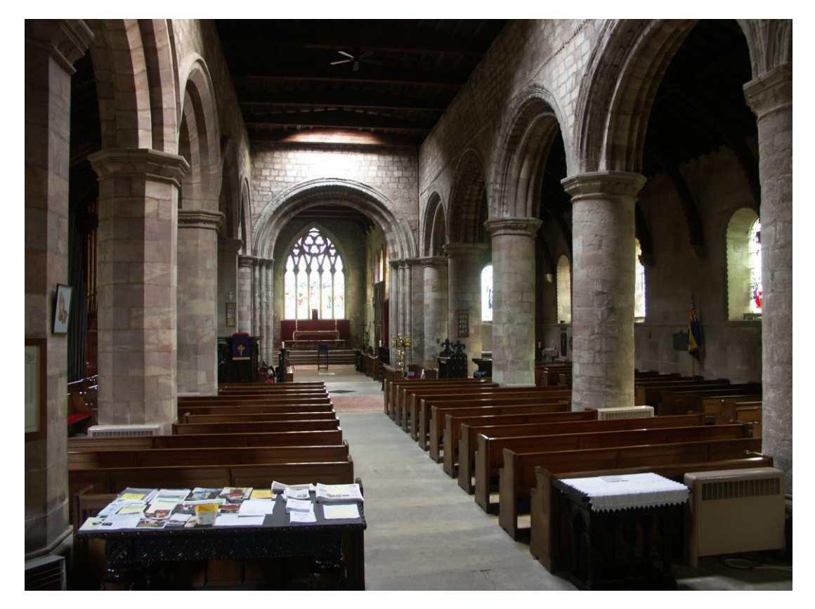
Interior looking east

carrying arched principals with Romanesque billet ornament, which is also used on the single purlin.