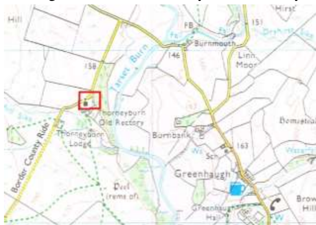
Location Map from Ordnance Survey 1:25000 sheet OL42 OS map licence 100045703

St Aidan's Church (NGR NY 7862087688), built by the Commissioners for Greenwich Hospital in 1818 to serve one of the most remote and thinly-populated rural parishes in England, stands on the west side of the Valley of the Tasset Burn, 7 km north-west of Bellingham. Thorneyburn is very much a dispersed settlement; the church stands on a minor road and is accompanied only by the former rectory, built at the same time, and, a little to the south, a later-19 th century school, now Thorneyburn Lodge. It is now a Grade II listed building, as are the Old Rectory and the nearby coach house/stable block.