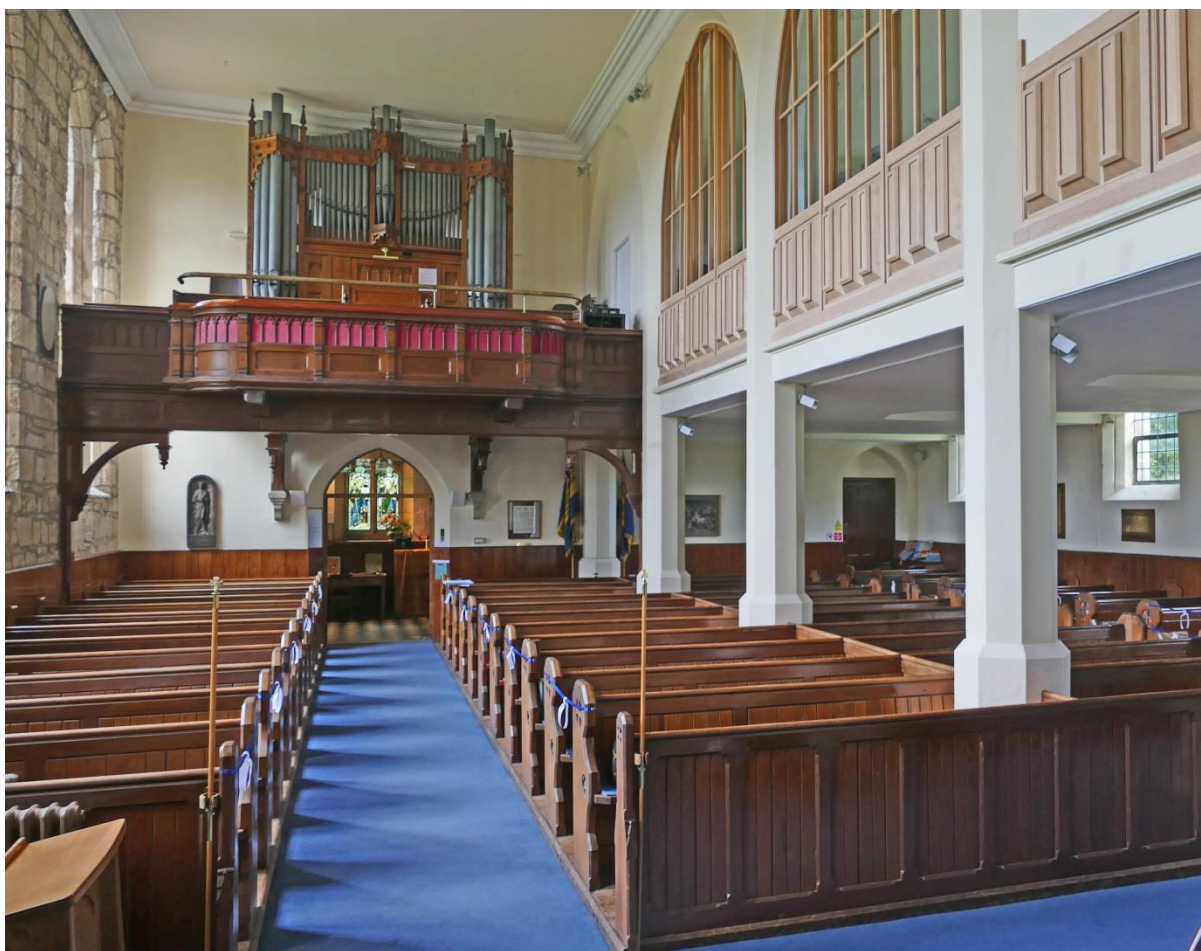
The nave looking north-west

several infilled sockets, which must relate to a roof structure prior to the present one. The west wall and tower arch is partly concealed by an elaborate organ loft, its rear supported by arch-braced wall-posts springing from shaped ashlar corbels on either side of the west door, and is front, just short of the westernmost pier of the north arcade, on a pair of wooden posts. The gallery, which is probably of later-19 th century date, ends c 1.5 m short of the south wall. The north arcade has four lofty segmental-pointed arches with chamfered surrounds, the chamfers being continued unbroken down the octagonal piers, which had high chamfered bases.