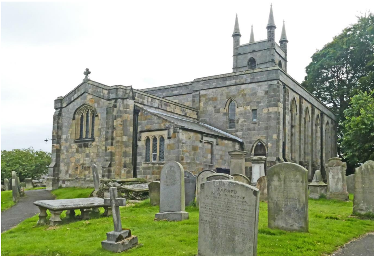
The church from the north-east