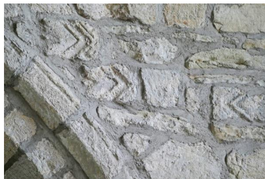
Re-used Romanesque stones l. and r. of arch