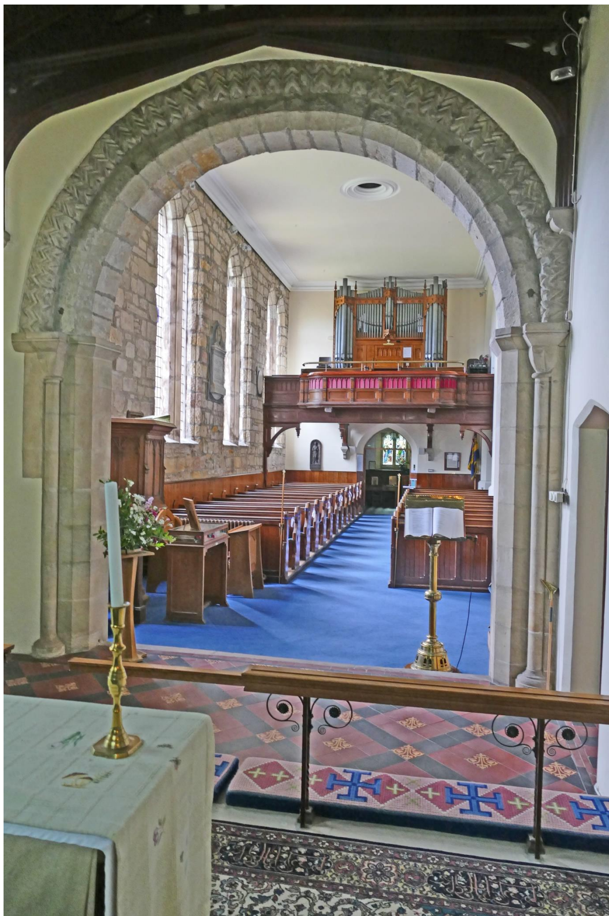
East face of chancel arch