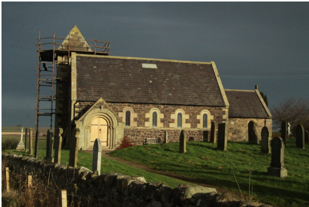
The church from the south, November 2012

St Paul's Church is a simple structure consisting of a nave, with a projecting tower at the north-west corner and a porch at the west end of the south wall, and a small chancel. The nave, tower and porch are constructed of roughly-coursed dark igneous rubble, with small packing pieces (or galleting) in the interstices between the larger blocks, and sandstone ashlar dressings. The side walls of the chancel are of older roughly-coursed rubble, but the east wall is of roughly-tooled coursed sandstone. The roofs are of Welsh slate.