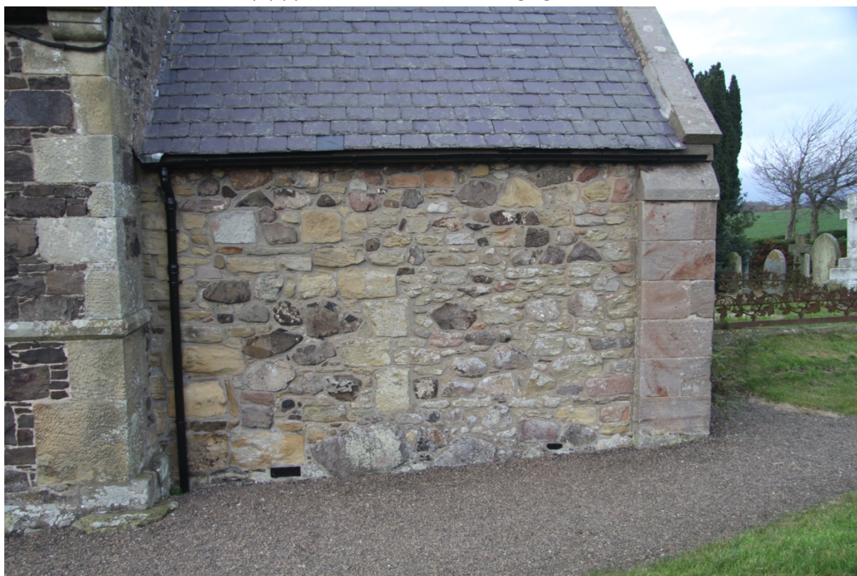
The south wall of the chancel; note apparent remains of west jamb of opening (near centre) and re-used (?) angle quoins at south-east corner of nave

The lower stage of the Tower has quoins like those of the nave, and rises unbroken to a stringcourse, again chamfered above and below, at the base of the belfry; the quoins of the belfry are of smooth ashlar. The lower stage has a small round-arched window on the west, and the belfry openings are paired round-arched lights having a mid-shaft with a simple cushion capital, chamfered imposts and linked hoodmoulds. The steeply pyramidal roof has overhanging eaves and is of stone.