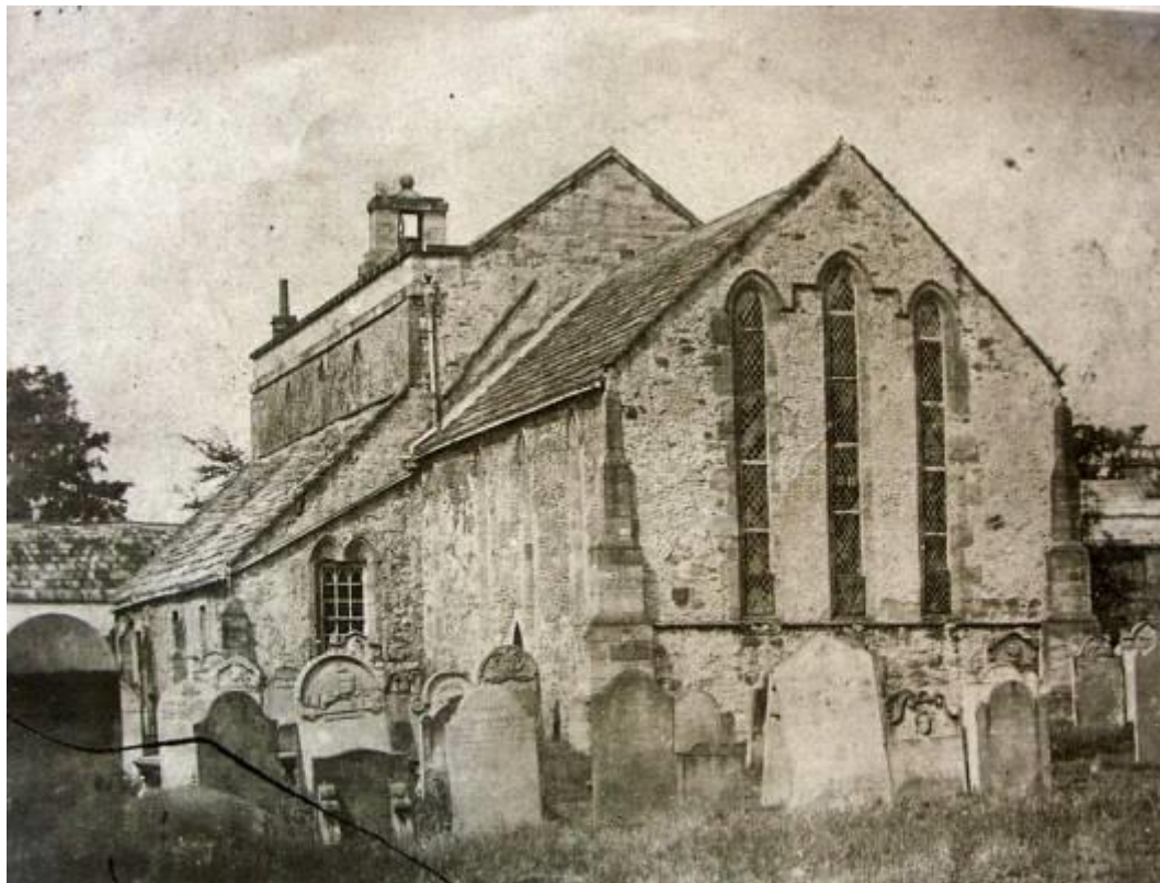
The church from the south-east, before the 1870 restoration