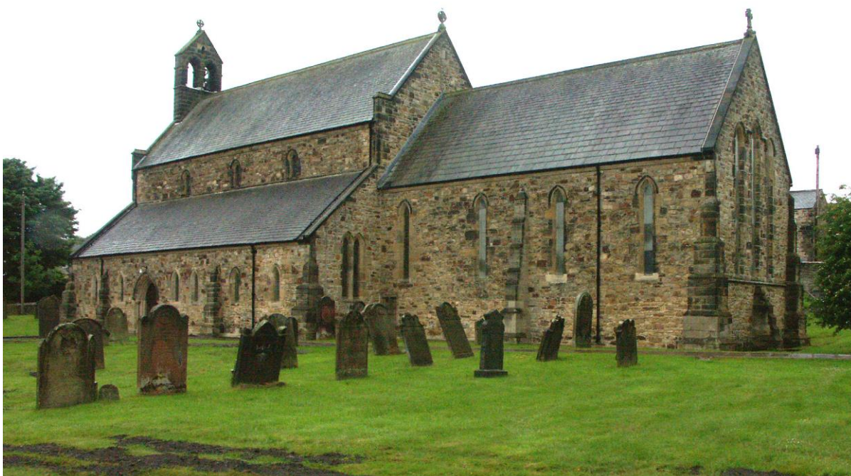
The church from the south-east