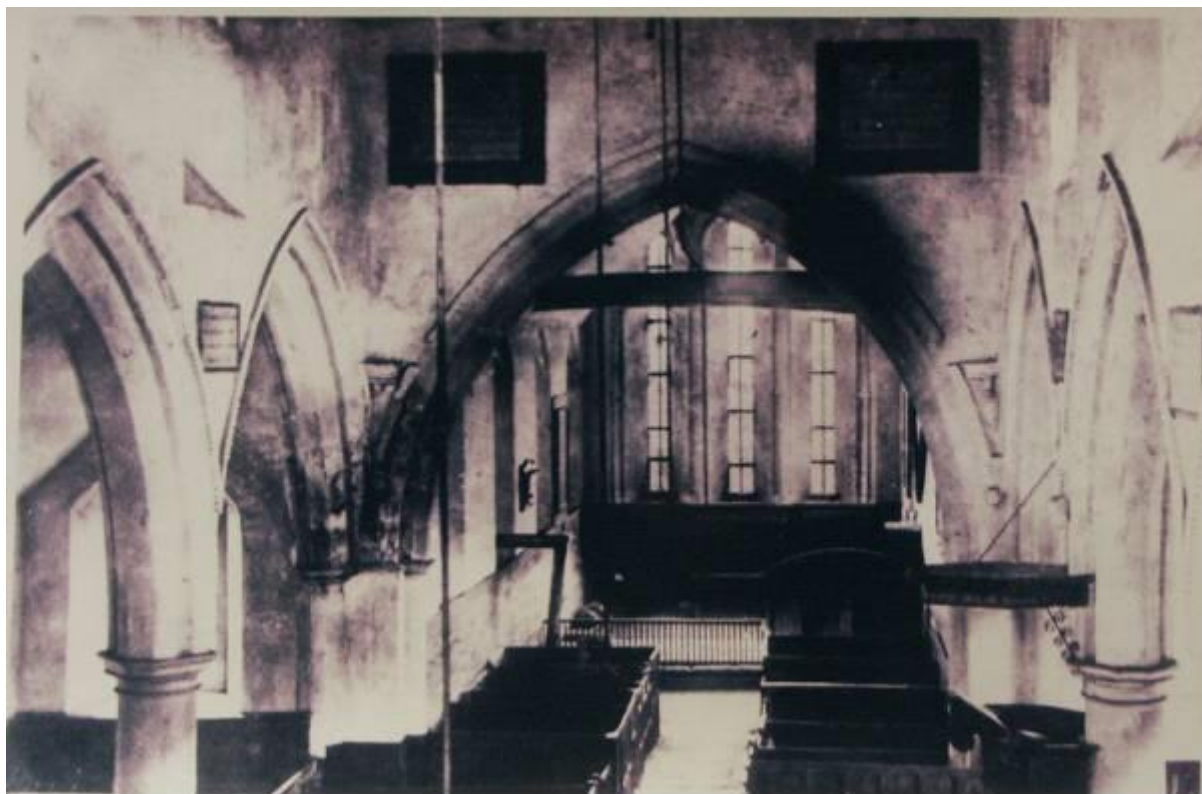
Interior view looking east before the 1870 restoration, taken from the western gallery

a new vestry with a heating chamber beneath. The doorway on the south side of the chancel was to be built up, and the sedilia (which its insertion had partly destroyed) to be repaired.