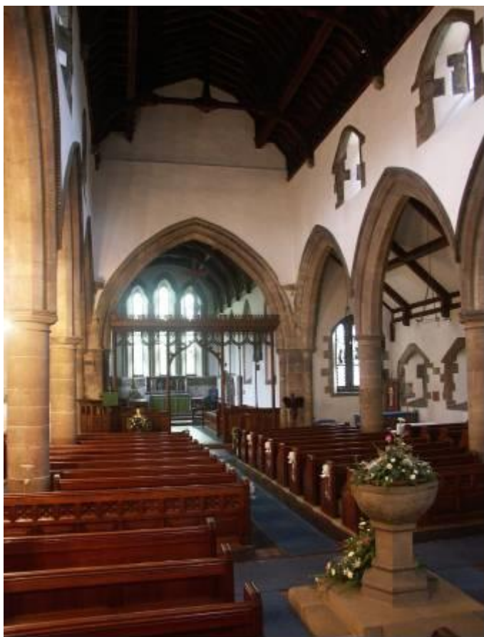
Interior looking east

In the North Aisle there is old stonework in the internal surround of the paired eastern lancets, the easternmost lancet in the north wall, and in the internal east jamb of the lancet west of the vestry. The original north door now opens into the vestry; it has a two-centred arch of three orders. The innermost has two continuous chamfers but the outer two have rolls with fillets and are carried on jamb shafts with moulded capitals and bases. Most of the stonework of the doorway is 1870 restoration; the jambs (and bases of the jamb shafts) and parts of the outer order are old.