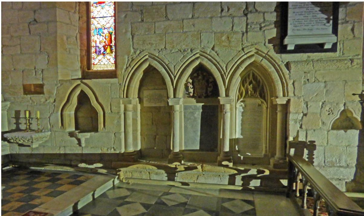
Piscinae and sedilia on south of chancel