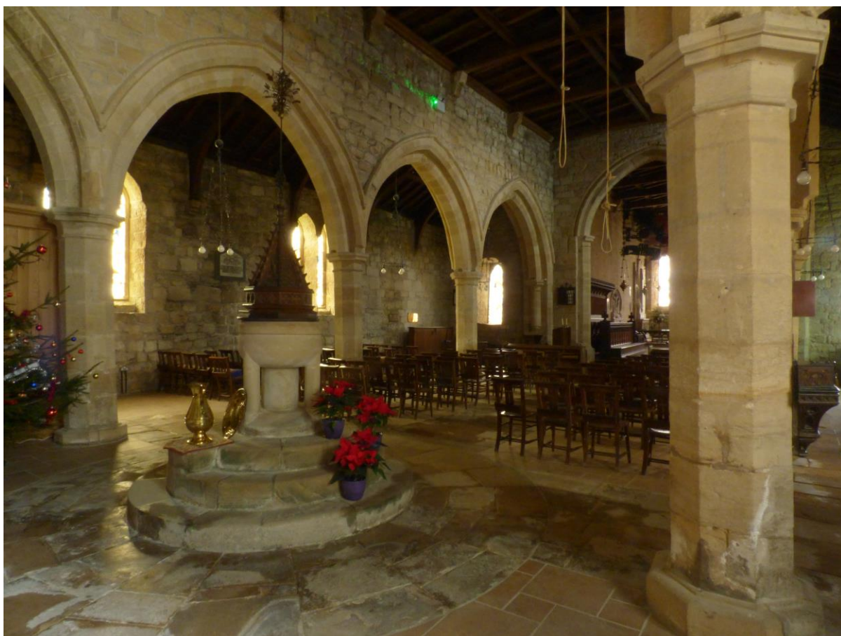
The nave, looking north-east

The west wall of the South Aisle , of squared tooled stone, has a shouldered rear arch to its small lancet window; the earlier roof line above is very clear. On the south the south door has a segmental rear arch and an infilled draw-bar tunnel in the internal east jamb. The internal jambs of the four pairs of 19 th -century lancets in the wall are crudely cut through the earlier masonry, except in the case of the easternmost where the lower part of the internal west jamb has three cut blocks (one below the present sill) which must relate to the earlier window of which the sill is visible externally. At the extreme east end of the wall is a piscina with a steep, almost stilted trefoiled arch with a filleted roll moulding and a bowl that may have been slightly trimmed back. The east end of the aisle has a lancet window with a very unusual shouldered and shaped rear arch; the lintel has a segmental cut-out with a roll at either end and a central roll with a fillet, all set at right angles to the wall; the sill is stepped. Higher in the wall two earlier roof lines are very clear.