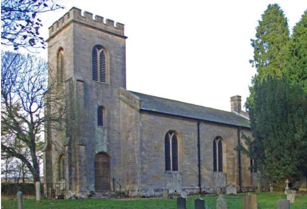
The Church from the South West