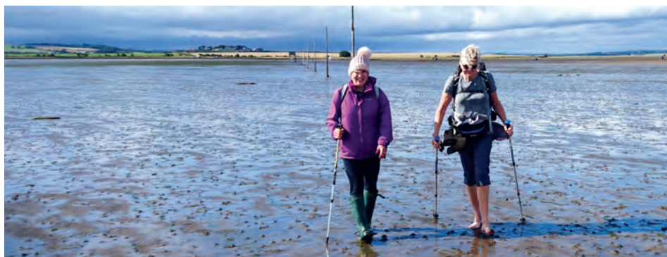
Walkers on the Pilgrims' Way, Holy Island

There is renewed interest in notions of pilgrimage in the 21st century. This may be influenced in part by films like 'The Way' and TV programmes about pilgrim routes or monasteries, and their appeal to a more individualistic approach to spirituality.